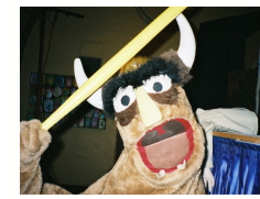
Blaster the Red

PUPPET SLAM Jan 4 & 5 at 8pm Adults Only puppet shows. Ages 21 and over only.